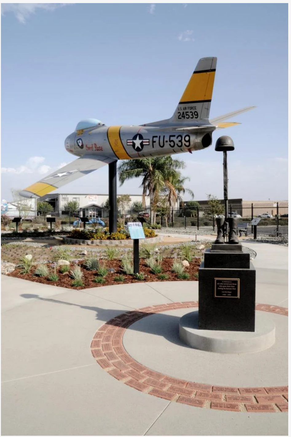
The central bronze monument near the pylon-mounted F-86 Sabre FRANK B MORMILLO

Scattered around the monument are memorial bricks purchased by the public in remembrance of individual fallen warriors from that conflict. The walkway which meanders through a park-like setting is dotted with educational sign boards providing specific details about the Korean War. WITH THANKS TO FRANK B MORMILLO