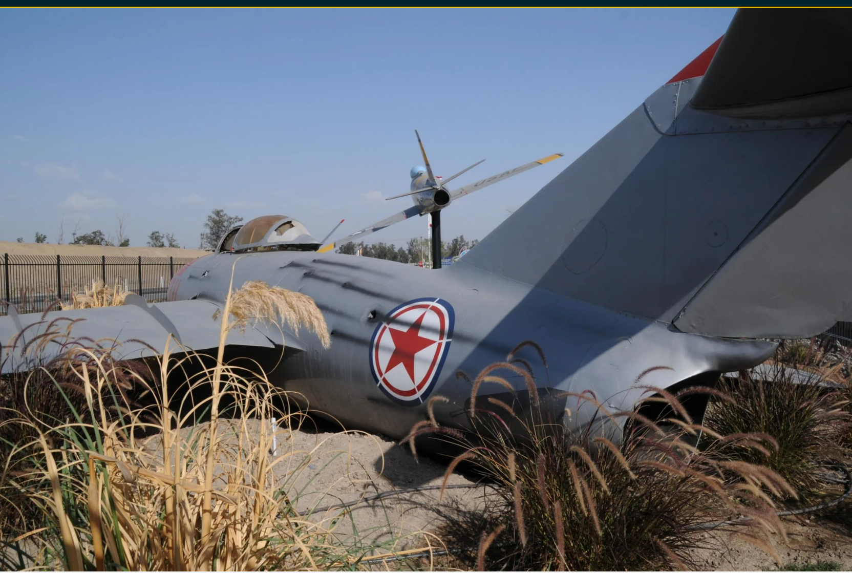
The 'downed' MiG-15 with the 'victorious' F-86 in the background FRANK B MORMILLO

Scattered around the monument are memorial bricks purchased by the public in remembrance of individual fallen warriors from that conflict. The walkway which meanders through a park-like setting is dotted with educational sign boards providing specific details about the Korean War. WITH THANKS TO FRANK B MORMILLO